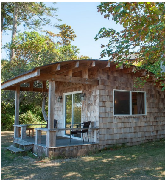
Nanoose is our beachfront honeymoon suite, located less than 100 ft. from the ceremony site.